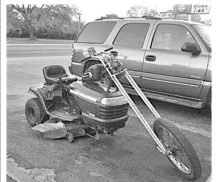
What on earth is this??

"My brain cells, skin cells and hair cells continue to die, but my fat cells seem to have an eternal life!"